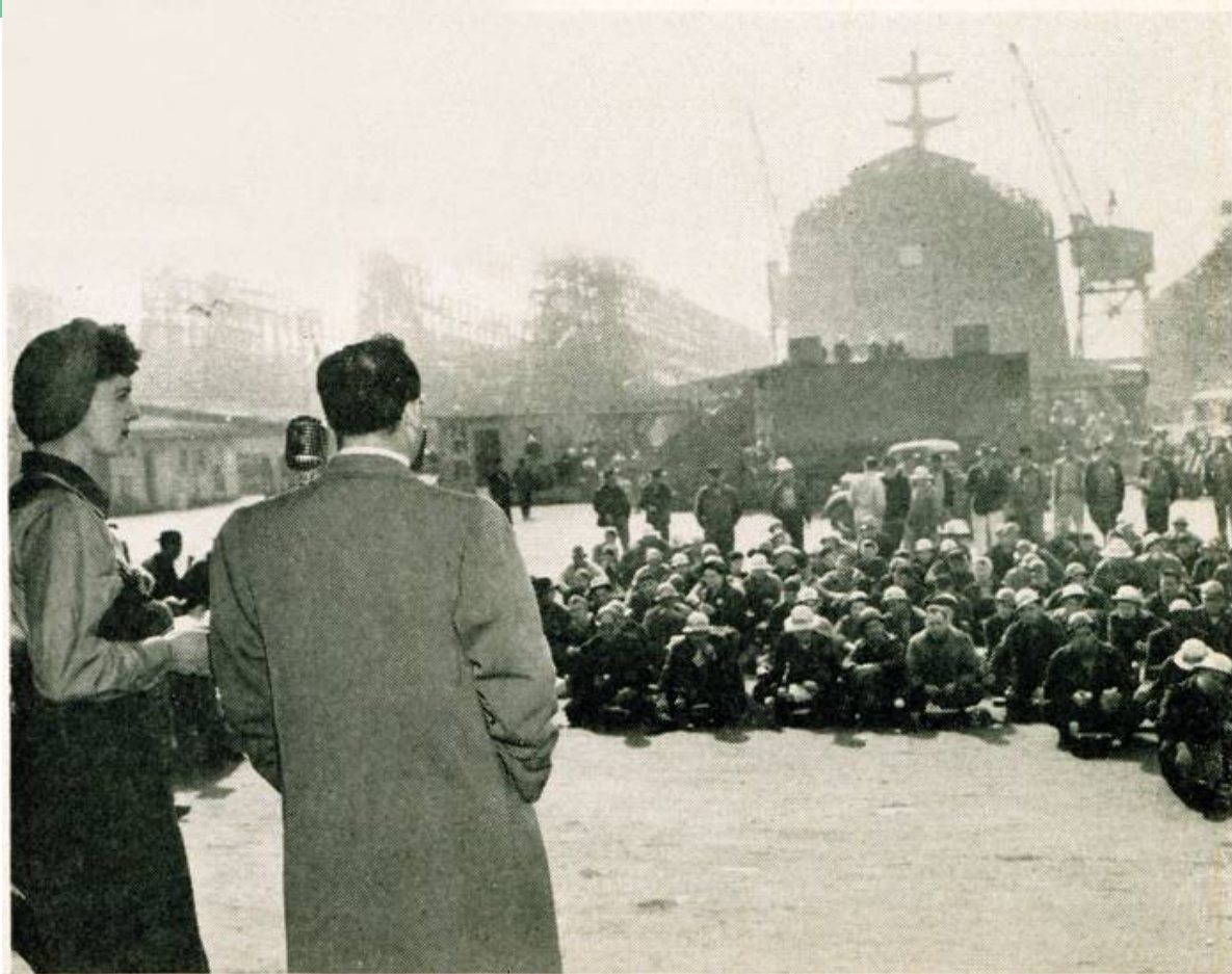
Noon-hour loudspeaker health education program in Kaiser Shipyard, Richmond. Staff physician talking on the common cold

From Industrial Medicine , 14:4, April 1945